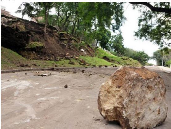
Fig. 14. Rock obstructing Luis Etchevere Avenue

The scenario in Figure 13 is similar to Figure 12. The landslide has caused a large amount of soil and rocks to fall onto the walk path below, which is on Laurencena Avenue. The path, which is made of brick, is covered in mud and debris from the hillside. The tree on the left side of the image is bent and damaged due to the landslide. Fortunately, there were not any people harmed during the incident.