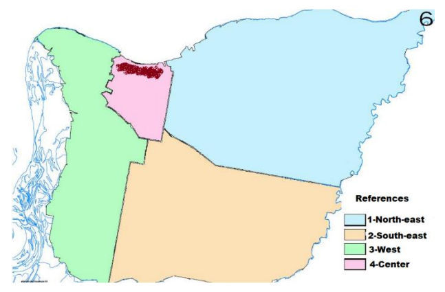
Fig 2. Districts of Paraná city.

As mentioned before, Paraná has four districts as can be seen in Fig. 2. These districts are going to be described until reaching the center of the city, where the problem is located.