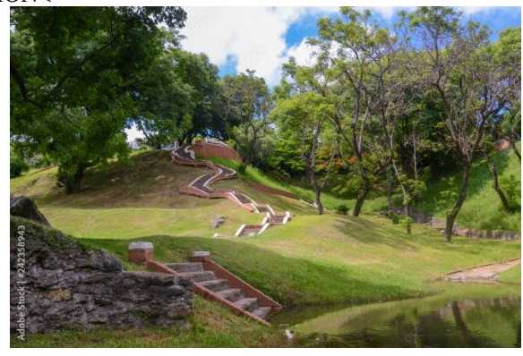
Fig. 9. Stone stairs and vegetation in Urquiza Park.