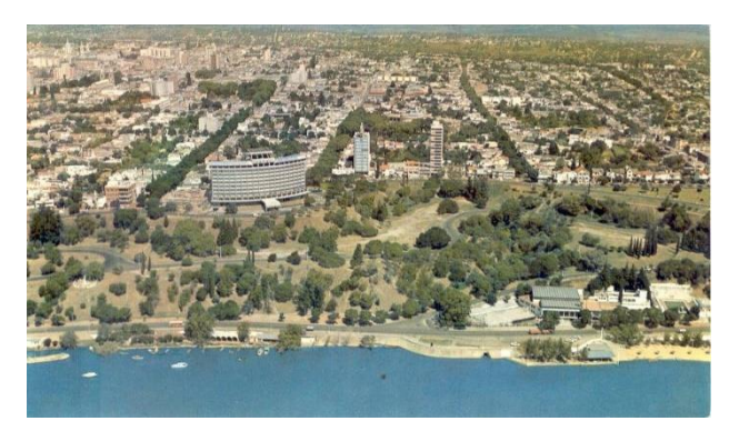
Fig. 7. The Urquiza Park.

This is the specific area where the problem is located. There are numerous hills that are prone to landslides and erosion between Laurencena Avenue and Luis Etchevehere Avenue, as Fig. 8 shows. These hills have an average height of 50 meters and there are many trees and stone stairs on them. Also, a lot of different kind of birds and small animals live in this area, so it is important to preserve the vegetation. The next pictures depict these areas.