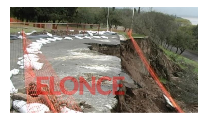
Fig. 12. Landslide caused by terrain movement.

As shown in Fig. 12, we can observe Luis Etchevehere Avenue surrounded by trees. The collapse of the road is evident, with large sections of broken pavement. The scene depicts the consequences of a landslide that has disrupted the calm of the landscape. The once-smooth surface of the road is now completely unusable and there is a big impact on the environment produced by rubble.