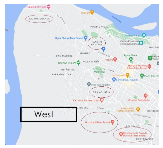
Fig 5. Landmarks in the west area.

Figure 5 shows the west area of Paraná city, which is characterized by its diversity and important services. In this area, there is the Military Hospital, a healthcare center specialized in providing medical services to military personnel and their families. Additionally, there is the Baxada Hospital, which is a health clinic center. Moreover, there are some neighbourhoods named San Agustin, Bajada Grande, and Pancho Ramirez, which are quite important in the residential areas.