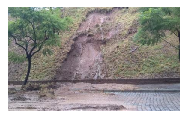
Fig. 13. Landslide due to diluvium.

The scenario in Figure 13 is similar to Figure 12. The landslide has caused a large amount of soil and rocks to fall onto the walk path below, which is on Laurencena Avenue. The path, which is made of brick, is covered in mud and debris from the hillside. The tree on the left side of the image is bent and damaged due to the landslide. Fortunately, there were not any people harmed during the incident.