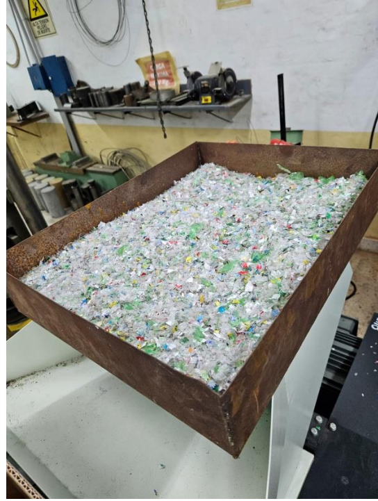
Fig. 18. PET fibers.

The next step involves manufacturing a geotextile. The flakes are carried to the processing plant, located in the Industrial Park in Paraná, where they are melted and molded to create a geotextile. This material is the base for this project because it has important properties that improve the soil, such as high tensile strength and permeability control. Allowing water to drain through it is necessary to prevent soil saturation, which leads to erosion. This is why it is important to stand out this last property. Fig. 19 shows the final manufactured product.