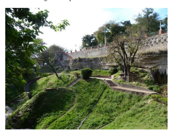
Fig. 11. Stone stairs and vegetation in Urquiza Park.

As it can be seen in the pictures above, Urquiza Park is an important natural part of the city because there is a lot of vegetation and recreational areas. These places are mostly crowded on weekends by tourists and local people, so it is important to keep this area safe.