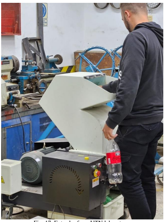
Fig. 17. Extruder from UTN laboratory.