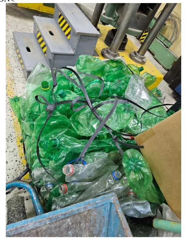
Fig. 16. Plastic bottles collected from supermarkets.

It is known that the amount of plastic discarded daily in Paraná is huge. In this sense, an important part of clean plastic is collected from supermarkets (Fig. 16), such as packaging and empty bottles. Continuing with the process, they are taken into an extruder, as shown in Fig. 17, which chops the bottles into small pieces. The result is plastic flakes, or PET fibers, ready to the next step. These PET fibers are visible in Fig. 18.