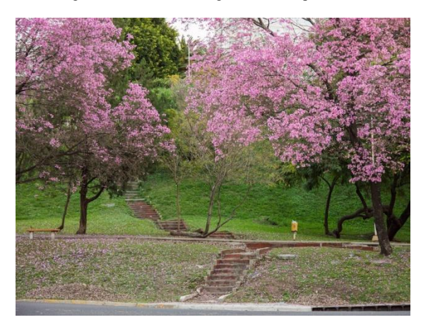
Fig. 10. "Lapachos" trees on the hills.