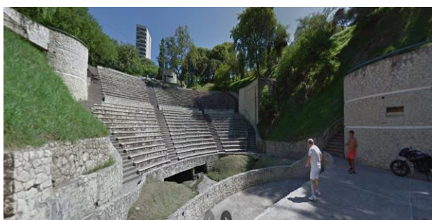
Fig. 15. Amphitheater located in Urquiza Park.

There are other sequels related to economic losses and damage. The economic costs of landslides include the expenses for repairing and rebuilding damaged infrastructure and covering emergency response, which can be substantial. Also, tourism can be affected if landslides damage tourist infrastructure, such as hotels, roads, and attractions. For example, the Amphitheater, shown in Fig. 15, which is an iconic place of Paraná, can be destroyed if a landslide takes place. Moreover, landslides can damage utility infrastructure, including power lines, gas pipelines, and water supply systems in Urquiza Park. This can result in power outages, gas leaks, and water shortages, affecting the daily lives of nearby residents.