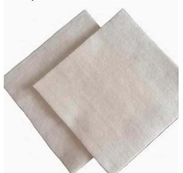
Fig. 19. Geotextile made 100% of PET fibers.

The next step involves manufacturing a geotextile. The flakes are carried to the processing plant, located in the Industrial Park in Paraná, where they are melted and molded to create a geotextile. This material is the base for this project because it has important properties that improve the soil, such as high tensile strength and permeability control. Allowing water to drain through it is necessary to prevent soil saturation, which leads to erosion. This is why it is important to stand out this last property. Fig. 19 shows the final manufactured product.