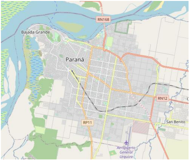
Fig. 1. General map of Paraná city.

As mentioned before, Paraná has four districts as can be seen in Fig. 2. These districts are going to be described until reaching the center of the city, where the problem is located.