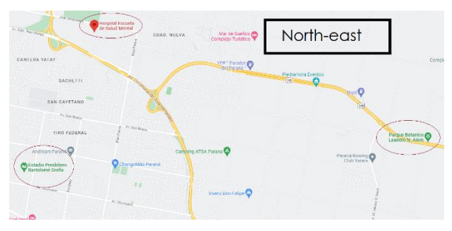
Fig 3. Landmarks in the northeastern area.

In the north-east of Paraná city (Fig, 3), there is a famous football stadium known as Presbítero Bartolomé Grella Stadium, the home stadium for Atlético Patronato Club. Also, there is a green area named as Jardín Botánico, which is a beautiful natural space with a wide variety of flora and fauna, and the Mental Health Teaching Hospital, which is an important healthcare center in the region.