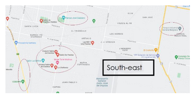
Fig. 4. Landmarks in the southeastern area.

characteristic places include Gazzano Park, which is rich in vegetation and serves as a recreational area. Additionally, there is an industrial park, which is specifically designated for all industrial activity in the city. Lastly, there is a roadway to Oro Verde, a small town near Paraná.