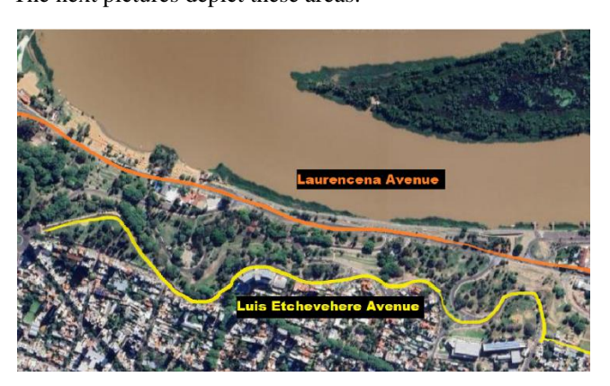
Fig. 8. Hills between the avenues.

This is the specific area where the problem is located. There are numerous hills that are prone to landslides and erosion between Laurencena Avenue and Luis Etchevehere Avenue, as Fig. 8 shows. These hills have an average height of 50 meters and there are many trees and stone stairs on them. Also, a lot of different kind of birds and small animals live in this area, so it is important to preserve the vegetation. The next pictures depict these areas.