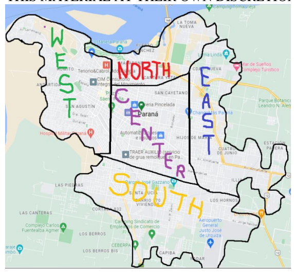
Fig. 2. Map of the Areas of the City of Parana [2]