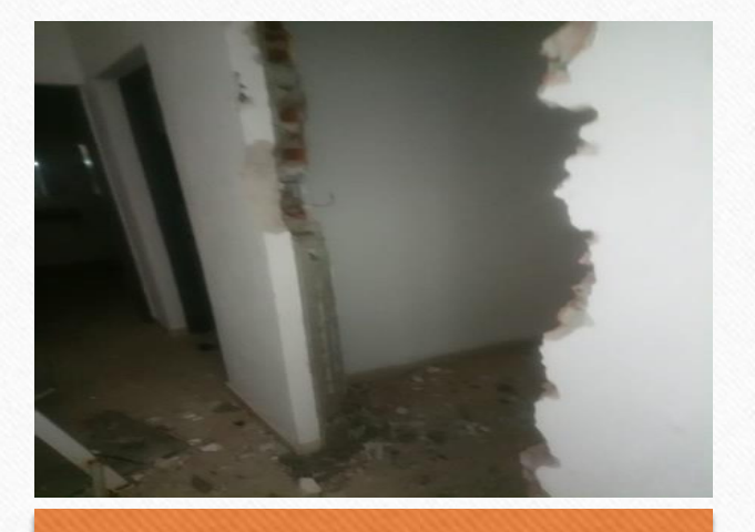
Acts of vandalism