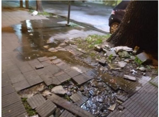
Fig. 4. Water gushing onto the sidewalks.

In Fig. 3, we can see one common situation in "La Santiagueña" neighborhood. This pipe has been broken for a long time.