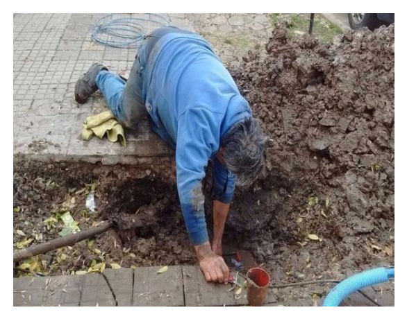
Fig. 3. A broken pipe.

In Fig. 3, we can see one common situation in "La Santiagueña" neighborhood. This pipe has been broken for a long time.