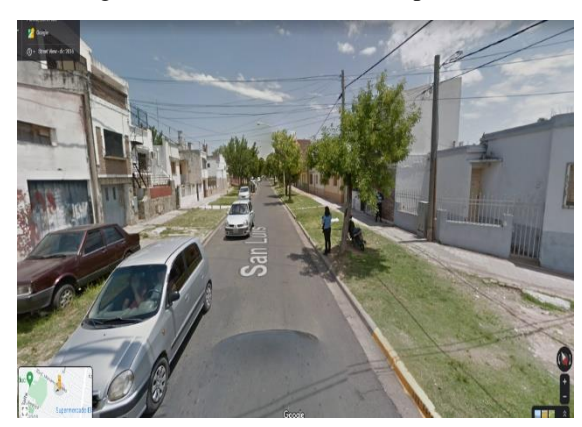
Fig. 2. La Santiagueña neighborhood.

Fig. 2 shows that it has a width sidewalk with grass and trees. There are around 20 houses per street and there is only one building which has 6 floors and 18 apartments.