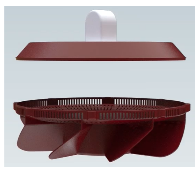
Fig [3]. The device with a filter [6]

This option is a great improvement over the original system, but it has a higher implementation cost and maintains the defect of the original system. The garbage can pass under the devices if it is heavy enough to submerge in the water because the devices are on the surface of the water.