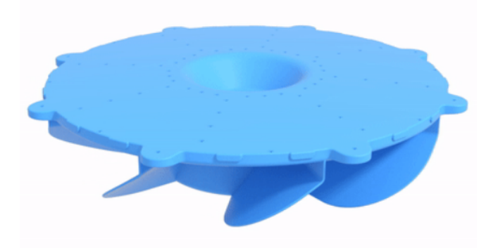
Fig. [1] The floating rotating device [6]

This system is very useful to clean the surface of the river but it does not manage to clean deeper parts of it, this is a problem because if the waste does not float, the collectors will not catch the garbage.