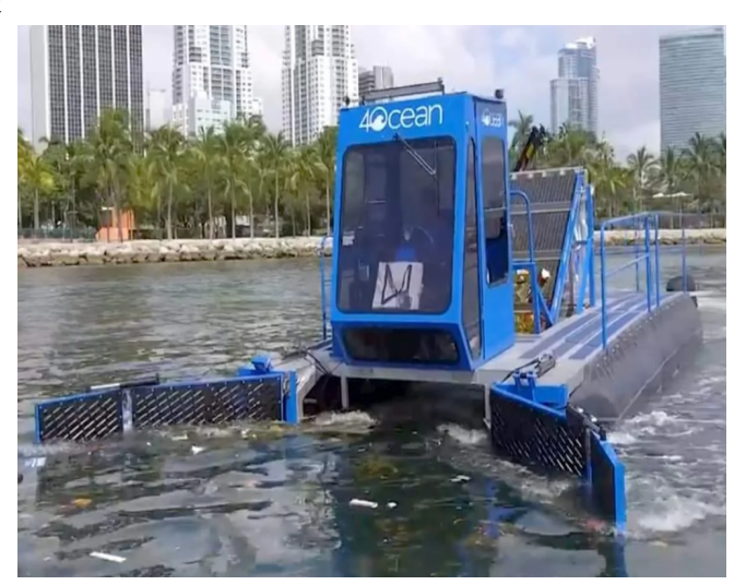
Fig[4]. The harbor skimmer from 4ocean [7]

This method has a drawback: there must be workers on the coast who are in charge of emptying and keeping the machine in good condition. However, since this system creates jobs it is not entirely negative.