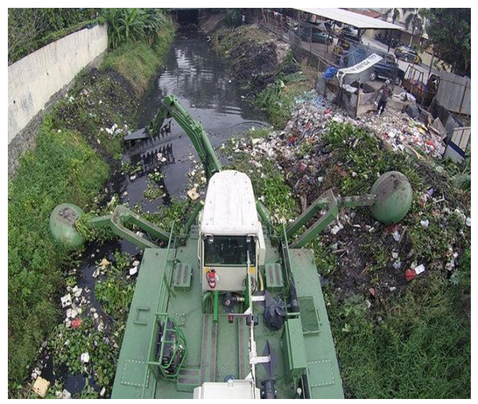
Fig[5]. The Multi-Purpose Amphibious Dredger working [8]

The problem with this machine is its maneuverability: since it is quite large and it is used in rivers with few millimeters of water, it must be handled carefully so that it does not get stuck.