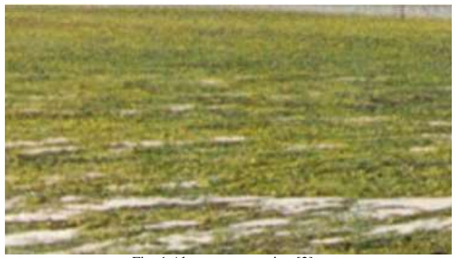
Fig. 1 Algae concentration [2]

In [2, Fig.1] the accumulation of algae in wastewaters due to the impact by high phosphate concentration is shown. When algae die, the process of decomposition entails a demand of up to 150 grams of oxygen per 100 grams of algae [2, p. 2], which brings disruptions to the aquatic ecosystem.