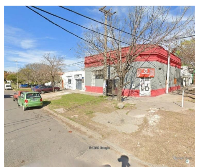
Fig. 3. Electromechanical workshop at the intersection of Ejercito Avenue and Gutierrez Street.

There are three points of interest at the corner of Ejército Avenue and Gutiérrez Street. These are Tuki (Fig. 3), which is an electromechanical workshop, and a beverage distributor. In the corner next to the beverage distributor, you can find Mundo Muebles (Fig. 4), which is a furniture shop.