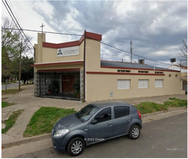
Fig. 11. Adventist Church.

Gutierrez Street is a very important road because it hasshops andworkshops. The peoplewalk along Gutierrez Street ordrive across it with their cars, so this street needs to be in good and accessible condition.