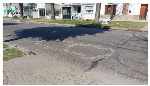
Fig. 12.Central Gutierrez Street, between Virasoro and Piran Streets.

The next picture shows one of the central points of Gutierrez Street, between Virasoro and Piran Streets (Fig. 12). In this image, the problem is more visible because there is a large pothole, and the problem is marked by the lines that surround it. This pothole will be deeper and larger if the problem is not solved on time. The solution for this problem is not a patch because the underlying structure is experiencing failure, so it requires a structural reconstruction.