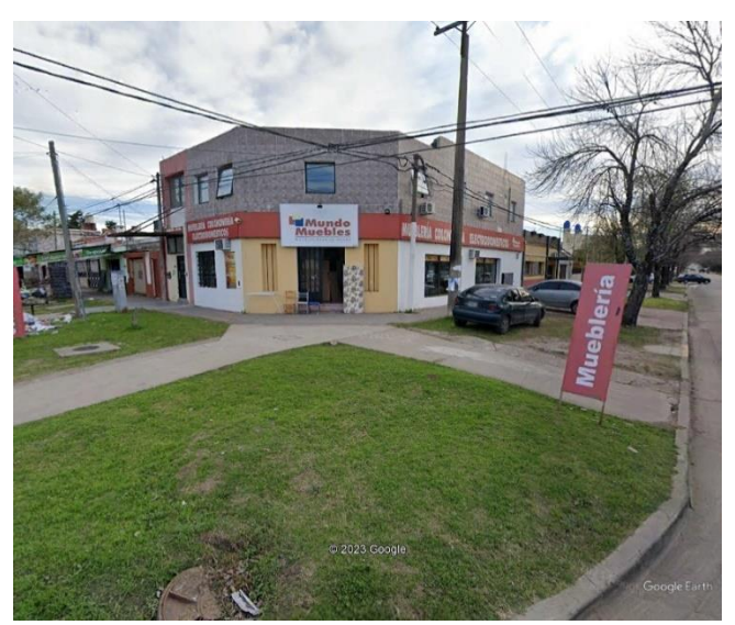
Fig. 4. Mundo Muebles furniture store.

In the next blocks, there are other important landmarks in the area. There is a nursery, a mechanical workshop (Fig.6), and a radio broadcasting station (Fig.7). In the middle of the stretch there is a veterinary clinic (Fig.8), a butcher shop (Fig.10), a pantry (Fig.9), and a gym.