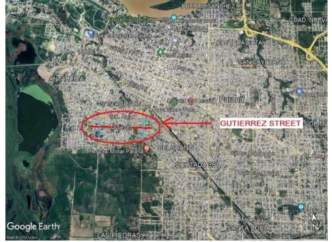
Fig. 1. Gutierrez Street highlighted on the map of Paraná (Image from Google Earth).

This street runs through a large part of San Agustín neighbourhood, and it is quite busy during the day. This street is important because a lot of people drive through it every day, as it serves as a vital connection between the houses and the workplaces of the citizens.