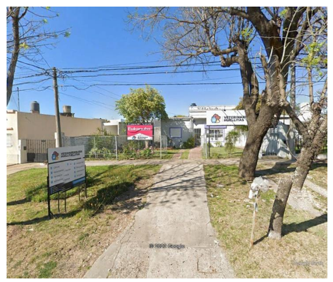
Fig. 8. Veterinary clinic.

At the end of the street in the west, there is an Adventist Church (Fig.11), a greengrocery, and an Asian supermarket which is on Selva de Montiel Street. This last part of the road is a residential area compared to the other parts because there are fewer shops.