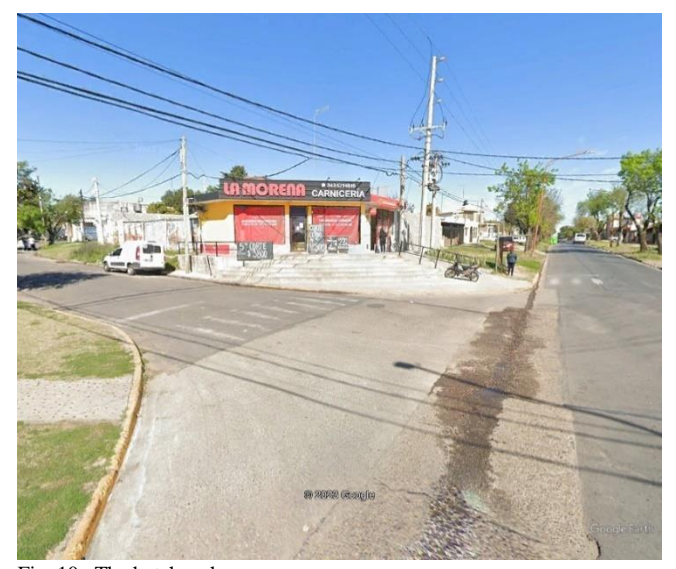
Fig. 10. The butcher shop.

At the end of the street in the west, there is an Adventist Church (Fig.11), a greengrocery, and an Asian supermarket which is on Selva de Montiel Street. This last part of the road is a residential area compared to the other parts because there are fewer shops.