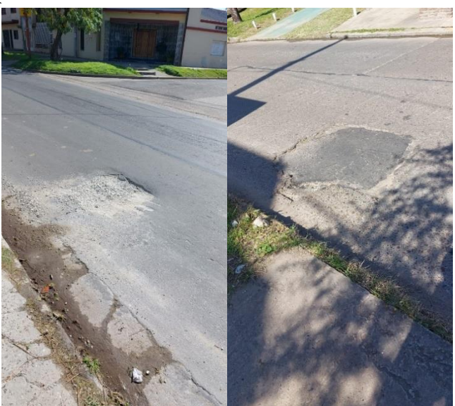
Fig. 10. Pothole at the intersection Fig. 11. Pothole at the corner of of Coronel Martinez Street. Virasoro Street.

These two pictures below show potholes which are found on Gutierrez Street. The first one is at the intersection of Coronel Martinez Street (Fig. 10). This pothole is very deep because many cars drive over it. The second picture is at the corner of Virasoro and Gutierrez Streets (Fig. 11). In this pothole there is a patch, but it has sunken because there is heavy traffic at this intersection. At night, this street is very dark so these two potholes are dangerous to the cars.