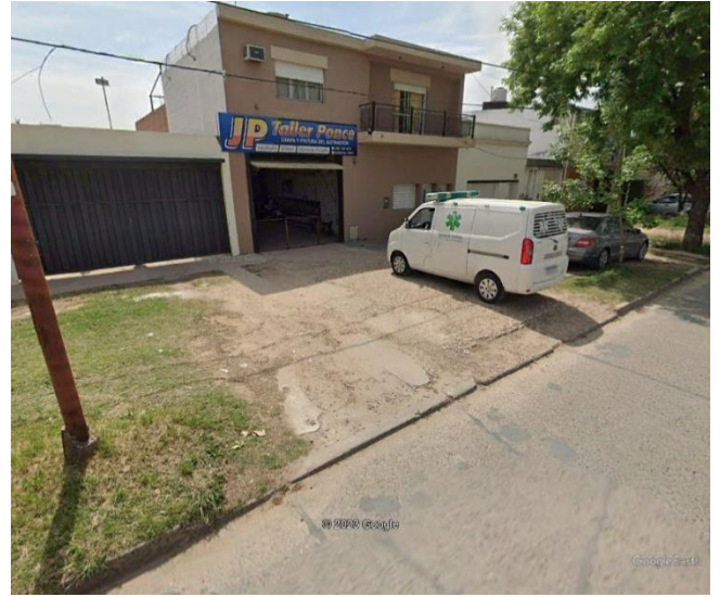
Fig. 6. The mechanical workshop and the nursery.