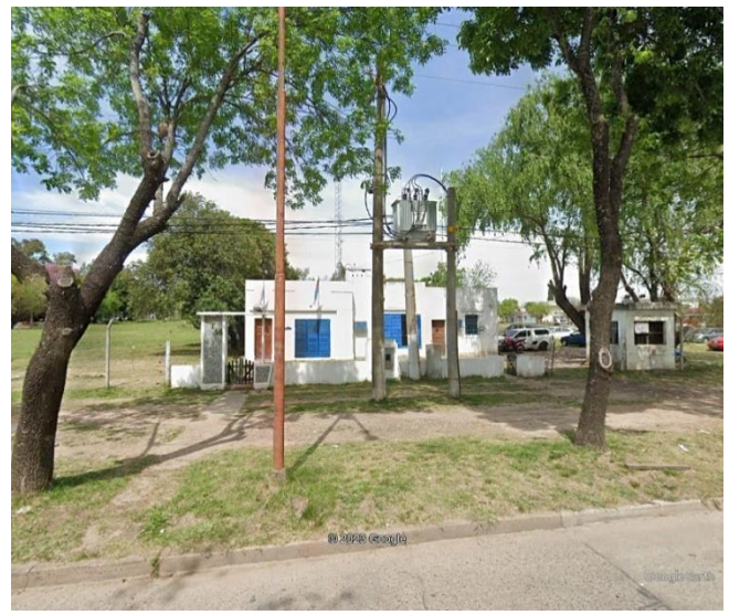
Fig. 7. The radio broadcasting station.