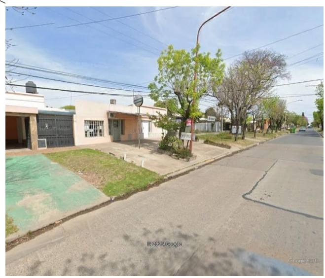
Fig. 9. The pantry.