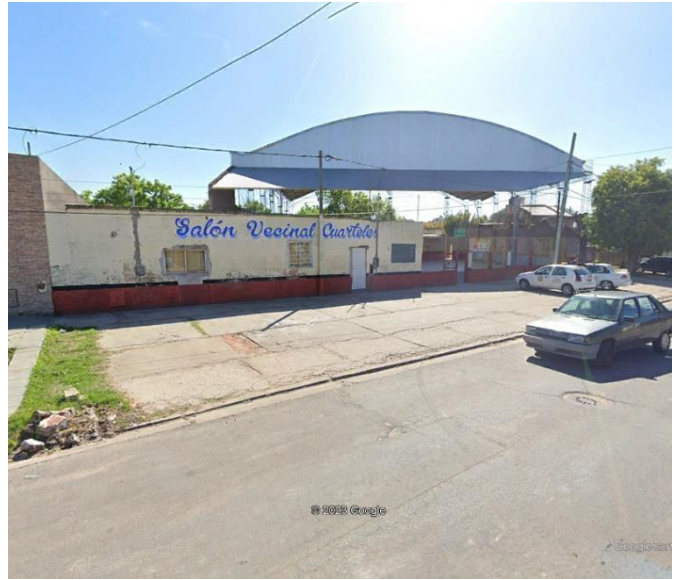
Fig. 2. Ejército Avenue Athletic Club.

On the eastern side of the road, there is a roundabout which connects two unnamed streets with Street 257 and Gutierrez Street. Moving towards Gutierrez Street and Ejército Avenue, you can find Ejército Avenue Athletic Club (Fig. 2), which is one of the most prominent landmarks in the area.