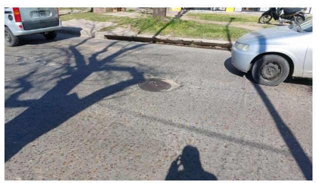
Fig. 13. Storm drain in Gutierrez Street.

There is anotherpothole located within a storm drain (Fig. 13). In this case, the depth is more evident. If cars drive over it, these could damage the storm drain because of their wheels' impact.