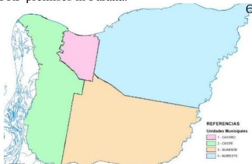
Fig. 2. Paraná city map.

Paraná is divided into four big municipal areas as indicated in Fig. 2. Although Paraná is not as busy as big cities, it still has its own way of life. People there do their daily tasks, businesses run, and cultural events take place. These activities can impact the local bird ecosystems. However, the focus of this work is on the area surrounding UTN FRP premises in Paraná.