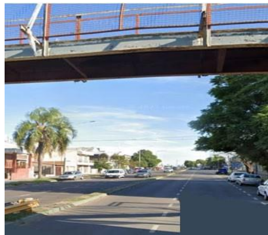
Fig 5. Bridge on Almaguer Avenue.