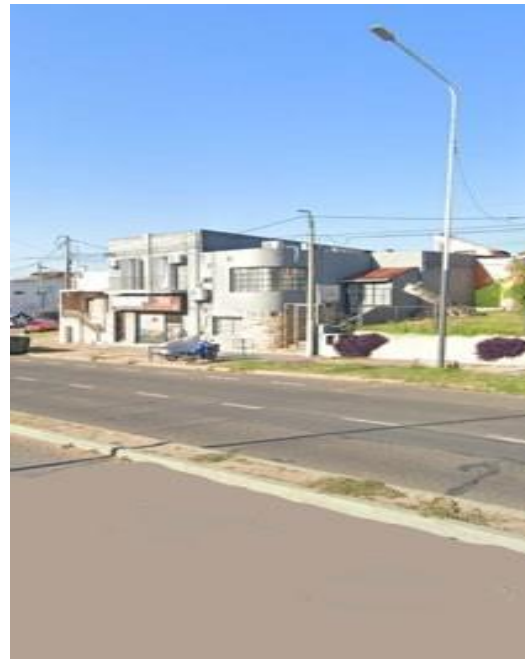
Fig 8. Shops nearby UTN.

Figure 8 shows the different shops which are near UTN FRP. For example, there are well-known shops like Cetrogar, which is on the corner of Almagro Avenue and Garrigó Street, as well as Musimundo, which is on the corner of Almagro Avenue and Rondeau Street. There is a Día supermarket near these shops. Also, there is also a car dealer and a hotel, located on Almagro Avenue near UTN.