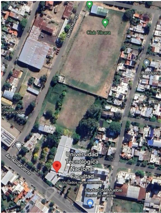
Fig 6. University surroundings.

> THIS IS AN ENGLISH AS A FOREIGN LANGUAGE ENGINEERING STUDENT PAPER. READERS MAY MAKE USE OF THIS MATERIAL AT THEIR OWN DISCRETION<