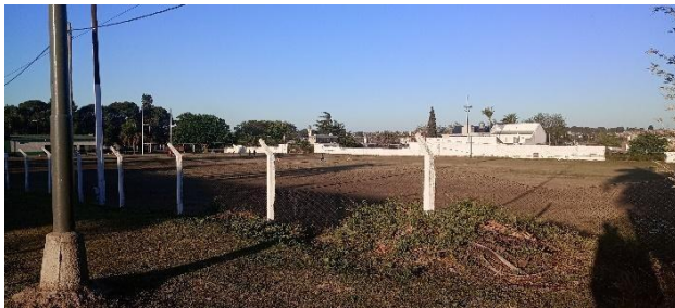
Fig 7. UTN's rugby field.

Figure 8 shows the different shops which are near UTN FRP. For example, there are well-known shops like Cetrogar, which is on the corner of Almagro Avenue and Garrigó Street, as well as Musimundo, which is on the corner of Almagro Avenue and Rondeau Street. There is a Día supermarket near these shops. Also, there is also a car dealer and a hotel, located on Almagro Avenue near UTN.