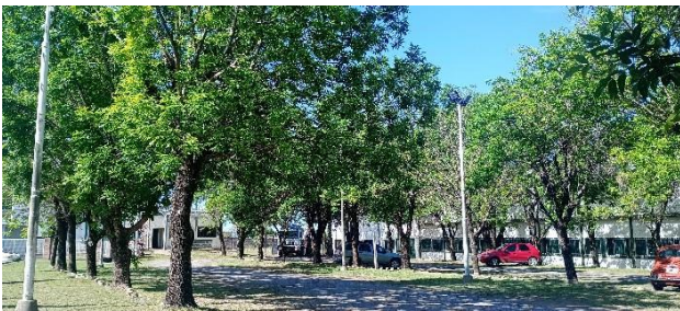
Fig 11. Trees in the university parking lot.

However, none of these locations offer access to water for the birds on the campus or in the area (Fig 11).