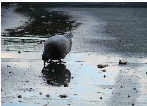
Fig 12. Bird drinking water from a dirty street puddle.

The easiest way to understand the importance of this problem is to compare the journey to get water of a city-dwelling bird to that of a rural bird. The bird which lives in less developed areas has access to many natural water sources. However, a city-dwelling bird does not have access to clean spots, so they often drink from dirty street puddles (Fig. 12).