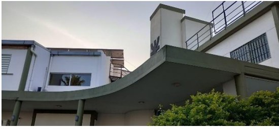
Fig. 9. UTN's gallery.

> THIS IS AN ENGLISH AS A FOREIGN LANGUAGE ENGINEERING STUDENT PAPER. READERS MAY MAKE USE OF THIS MATERIAL AT THEIR OWN DISCRETION<