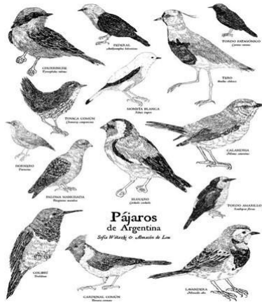
Fig. 1. Some of the main birds in Paraná area.

There are more than 300 specie birds that inhabit the surroundings of the Paraná River, such as woodpeckers, doves, mockingbirds, lapwings, carrion hawks, and others (Fig.1). It is common to see several of these species in the urban areas of Paraná city. It is obvious that the heart of a big city is not the best habitat for wildlife, mainly because birds do not have access to water sources there.