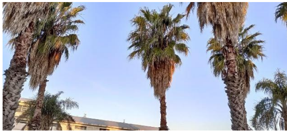
Fig 10. University palm trees.

Towards the rear of the UTN FRP, there is a green area with many trees where birds perch or make their nests.