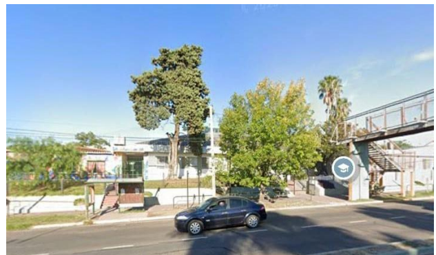
Fig 4. School opposite UTN.