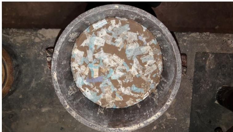
Figure 2. CBR test specimen surface with SFM content close to optimal

To establish the achievable structural responses, it is decided to use a methodology at the pre-feasibility level, which can be applied to low-traffic rural or urban roads (Rivera et al., 2018). The optimum content of SFM, is established for the Maximum Dry Density (DSMAX) and Optimal Moisture (HOPT), obtained with the corresponding Proctor Test, by the California Bearing Ratio (CBR) without embedding and on specimens molded at predetermined density (Figure 2).