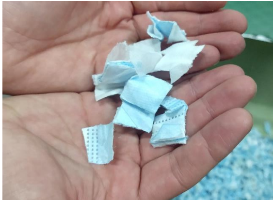
Figure 1. The product resulting from the trial shredding