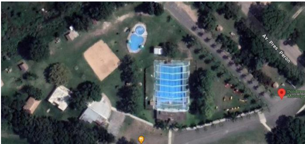
Fig. 3. Viale sports center.

Viale also has a sports center. The sports center includes a volleyball court, playgrounds for children, and two pools, one of which is heated. Various water sports are practiced there. Fig. 3 shows a satellite imagen of the sports center.