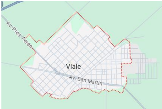
Fig. 2. Map of Viale, Entre Ríos.

> THIS IS AN ENGLISH AS A FOREIGN LANGUAGE ENGINEERING STUDENT PAPER. READERS MAY MAKE USE OF THIS MATERIAL AT THEIR OWN DISCRETION<