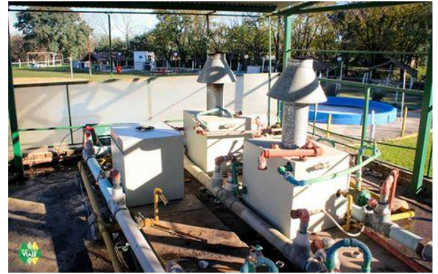
Fig. 4. Pool heating system.

Fig. 4 shows a picture of Viale sports center. In the background of the photo there is a lot of vegetation, a soccer field and a cold-water pool. In the middle of the picture is the pool heating system that runs on natural gas.