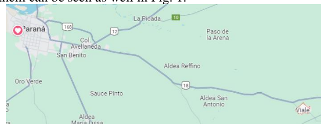
Fig. 1. Location of Viale in relation to Paraná.

Fig. 1 indicates where Viale is in relation to Paraná, and Fig. 2 shows a map of the city. The size difference of both places can be recognized and in the distance between them can be seen as well in Fig. 1.