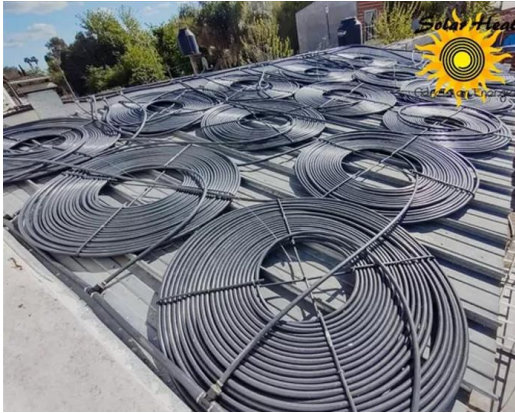
Fig. 5. Piping system

Black PVC (polyvinyl chloride) pipes are installed because they can absorb the sun's heat more effectively, as [3] shows. These pipes are exposed to the sun on the roof to maximize solar capture. Black PVC is especially efficient because it absorbs sunlight, heating up the material. Fig. 5 shows the piping system, in this case, they are in the form of coils.