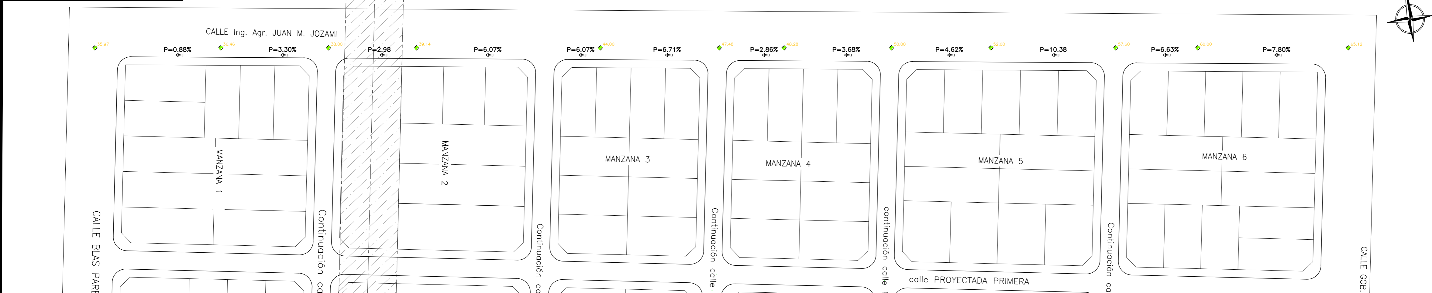
PERFIL LONGITUDINAL - CALLE JOZAMI