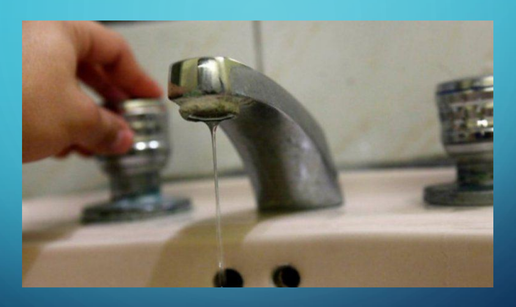
Water low pressure