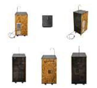
Fig. 1 Fresh Water Ecco System [6]

The Fresh Water Ecco System was created by Fresh Water Company and is made up of a recycled plastic box, shown in [6, Fig 1], which contains a system capable of collecting water from air humidity. This appliance works in the same way as the natural water cycle by which rain is produced recovering the water that is suspended in the air by condensation, collection, filtration, purification, and sterilization. Not only is the box made up of recycled materials, but the company also reuses electromechanical components as well.