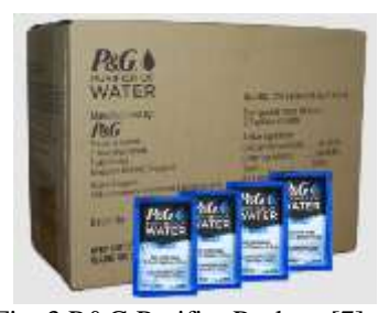
Fig. 3 P&G Purifier Packets [7]

The P&G Purifier Packets technology, which was developed by P&G company, is composed of a powdery material which is able to chemically react with water to obtain clean water, as shown in [7, Fig. 2]. One purifier packet is capable of quickly turning 10 liters of dirty water into clean and drinkable water. One packet contains 4 [g] of material.