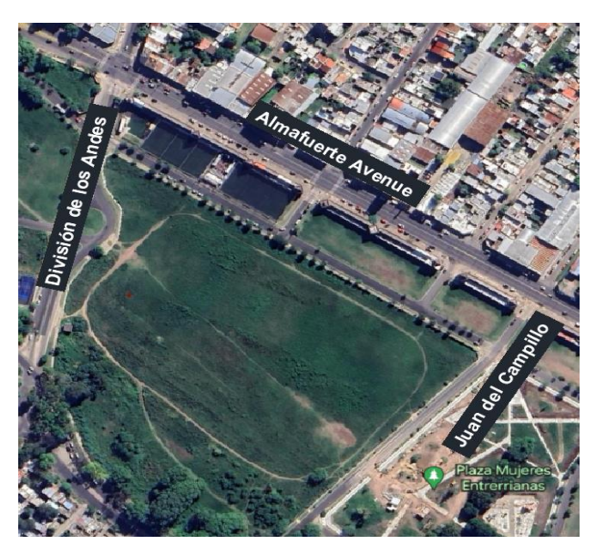
Fig. 2. Location of the affected place [2]

Fig. 2 indicates the location of the affected area which this work is about, it is located next to a large green space. This is the racetrack.