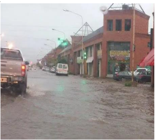
Fig. 3. Affected area on Almafuerte Av. [3]

Fig. 3 shows a photo on a day when Almafuerte avenue is flooded. It is evident what the problem is and what its consequences are. The photo shows the level that the water can reach and the seriousness of the problem.