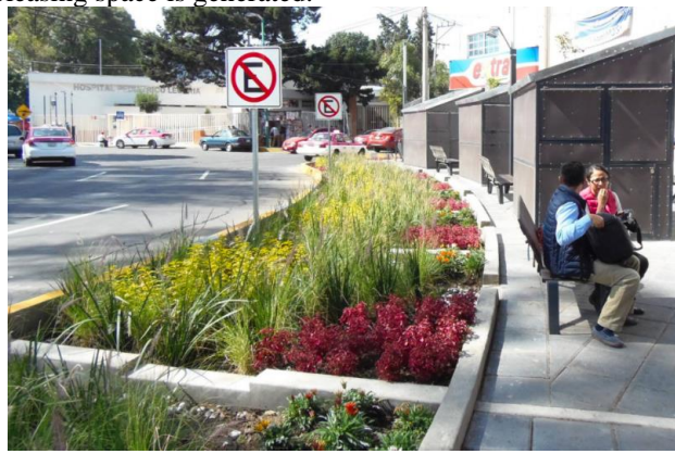
Fig. 4. Rain gardens [4]

In addition to creating green spaces, this project also proposes raising people's awareness about the importance of keeping public spaces clean. Garbage and debris accumulated in streets and gutters can clog storm drains, making the flooding problem even worse. By educating the city residents about the importance of properly disposing of waste and avoiding littering in the streets, storm drains can be kept free of blockages, and it is possible to ensure they work efficiently during rain events.