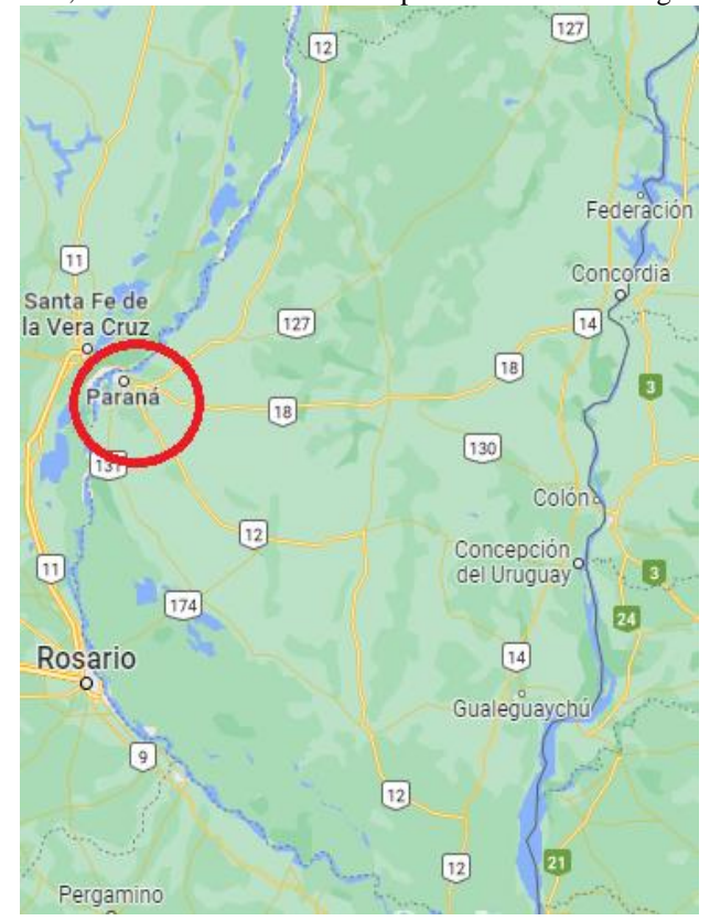
Fig. 1. Location of Paraná [1]

The Paraná River is one of the main attractions of Paraná. Its coasts offer beautiful landscapes and spaces for outdoor recreation, such as parks and beaches. The city also has a port that is used for navigation and fluvial transport. Fig. 1 shows the location of the city of Paraná in the province of Entre Ríos. The city borders a watercourse. This is the Paraná River, which is one of the most important rivers in the region.