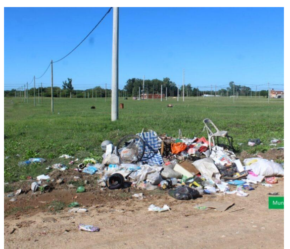
Fig. 6 Mini garbage dump in the street.

People also create small garbage piles in the streets [Fig. 6]. This especially happens in the most vulnerable neighbourhoods. As illustrated in this figure, residents dispose of various types of waste, but plastic materials are the most frequently found in these piles.