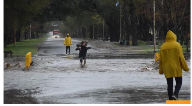
Fig. 8 Flood of May 24, 2023, in Viale.

In general, excess plastics in a small town like Viale can have detrimental effects on the environment, the city's infrastructure, as well as the public health.