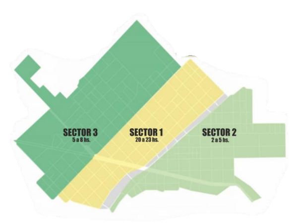
Fig. 2 Garbage collection sectors

As can be observed in Fig. 2, the city is divided into three sectors for garbage collection with its respective schedules. Also, Mondays, Wednesdays, Fridays are designated for organic garbage collection and Tuesdays, Thursdays and Saturdays are for inorganic garbage.