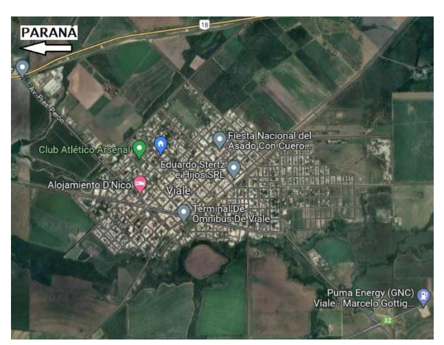
Fig. 1 Map of Viale.

As can be observed in Fig. 2, the city is divided into three sectors for garbage collection with its respective schedules. Also, Mondays, Wednesdays, Fridays are designated for organic garbage collection and Tuesdays, Thursdays and Saturdays are for inorganic garbage.