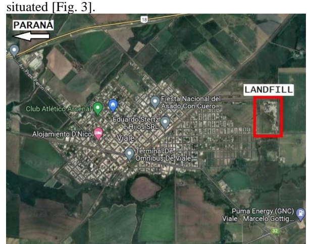
Fig. 3 Location of the landfill.

In Sector 2 [Fig. 2], the Viale garbage landfill is in the east of the city. Inside it, the waste separation chamber is