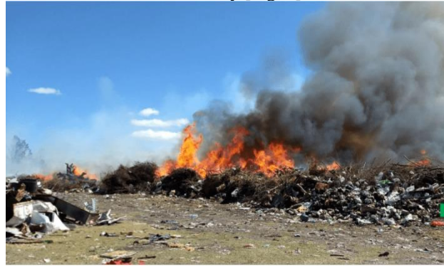
Fig. 7 Waste burning in the city landfill.

Occasionally, people burn waste in the city landfill. This is done to eliminate the surplus plastic that cannot be recycled. This practice results in a cloud of smoke that sometimes covers the entire city [Fig. 7].