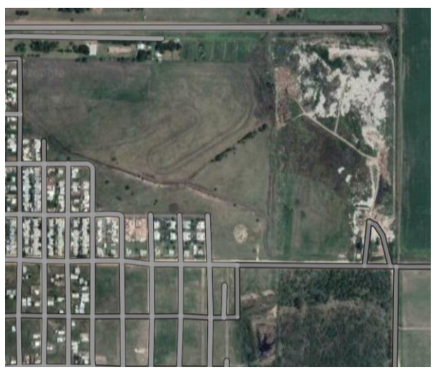
Fig. 4 Houses' proximity to the landfill.

In the past, the city landfill was designed to be far away from the city. However, due to the city's growth, the landfill is now very close to people's houses. This is a problem because the accumulation of garbage is growing too [Fig. 4].