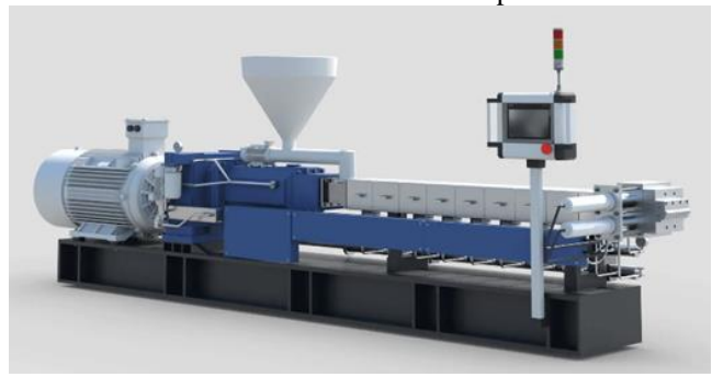
Fig. 9 PET Extruder Machine. [1]

The extrusion process involves heating and melting recycled plastic, which is then forced through a die to shape it into a continuous profile. This technique allows PET waste to be transformed into useful and functional forms, such as boards, pipes, sheets, filaments, or even granules that can be used as raw material to manufacture new products.