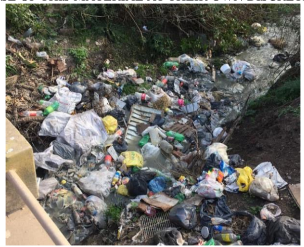
Fig. 5 Highly polluted water stream.

People also create small garbage piles in the streets [Fig. 6]. This especially happens in the most vulnerable neighbourhoods. As illustrated in this figure, residents dispose of various types of waste, but plastic materials are the most frequently found in these piles.