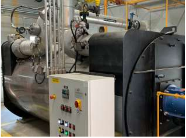
Fig 3. Thermal fluids heaters [9]

well-known, water, and oils. One of the fluids most used due to cost and efficiency considerations is oil.