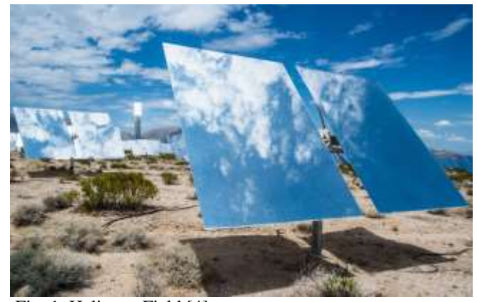
Fig. 1. Heliostat Field [4]

Standard heliostats usually have surface areas ranging from 40 to 60 square meters. The overall reflective surface is restricted to around 20 to 25 percent of the total land area. Normally, 70 percent of the solar beam that strikes the heliostats is directed towards the receiver [6, p 6].