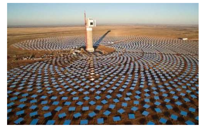
Fig. 2. Central Tower Receivers for Solar Thermal Electricity [8]

This part of the system is a heat exchanger mounted on a tower. Many designs with different configurations and heat transport fluid have been developed and tested. Currently, the tower supporting the receiver can be made of steel or concrete. They must support a great weight and adapt to different winds [6, p 7]. The sunlight that is sent by the heliostats is concentrated approximately 600 to 1000 times, reaching temperatures higher than 800°C [7, p 26]. A heat transfer medium, also referred to as working fluid, housed within the receiver tower, absorbs the highly concentrated radiation reflected by the heliostats and converts it into thermal energy which is used to generate supercritical steam. This steam can be stored or utilized to drive a turbine. The reflected solar radiation impinges on tubes through which the working fluid passes and that are arranged on the outside of a cylinder. The solar radiation impinges on the interior of a cavity lined with flow passages through which the heated working fluid passes. Some of these heat transfer mediums can include fluids like water, oils, molten salts, and liquid sodium. This method can directly replace natural gas in a gas turbine. This application has an excellent efficiency, around 60%. [7, p 32].