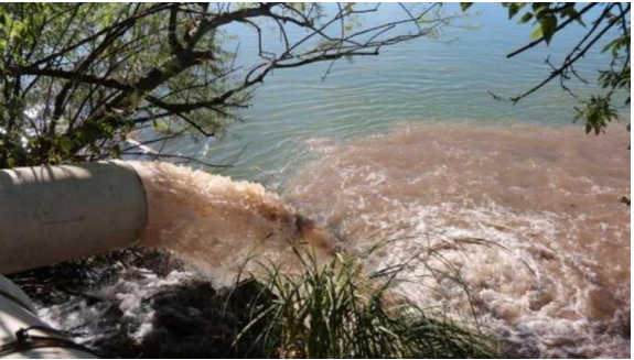
Fig. 6. Untreated wastewater accessing the Paraná River. [5]