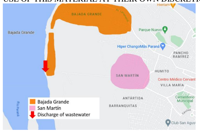
Fig. 2. Discharge of wastewater on the west of Paraná. [3]

Wastewater is collected in the sewer networks, as it can be seen in Fig. 3. It flows through the sewage network towards a main sewer, located in the western area of the city. The main sewer extends to the river and discharges the wastewater.