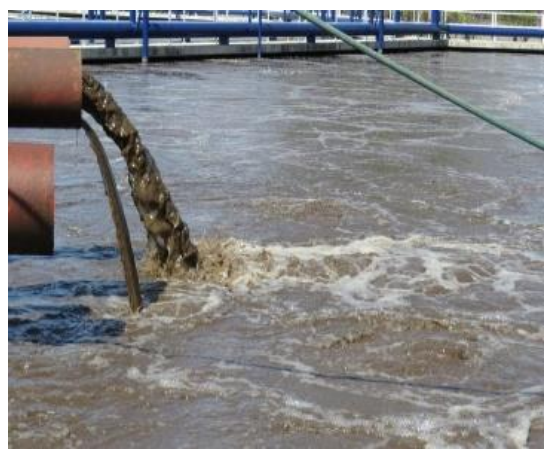
Fig. 5. Industrial wastewater [6].