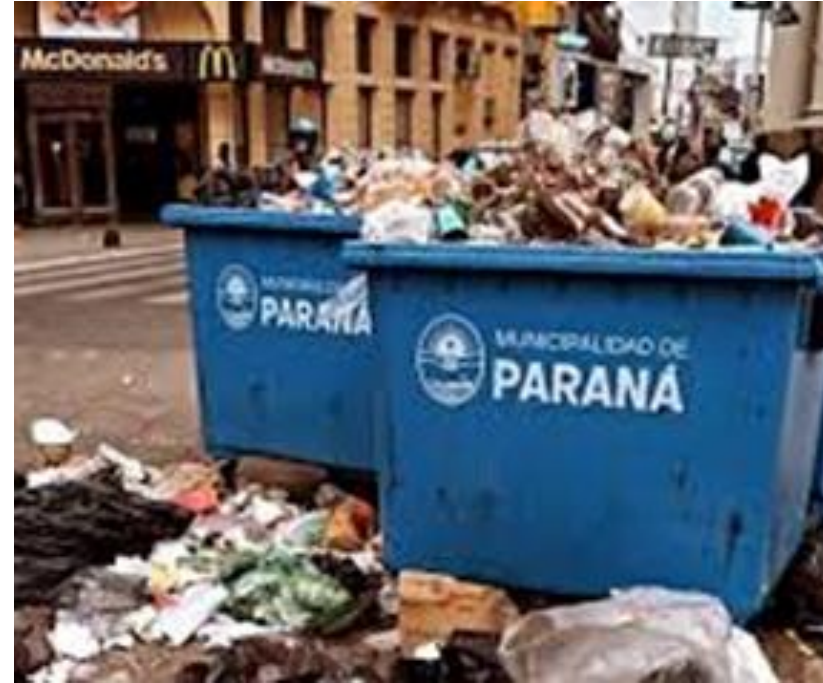
Garbage in downtown center of Paraná

DESCRIPTION OF SCENES THAT HELP PICTURE THE PROBLEM