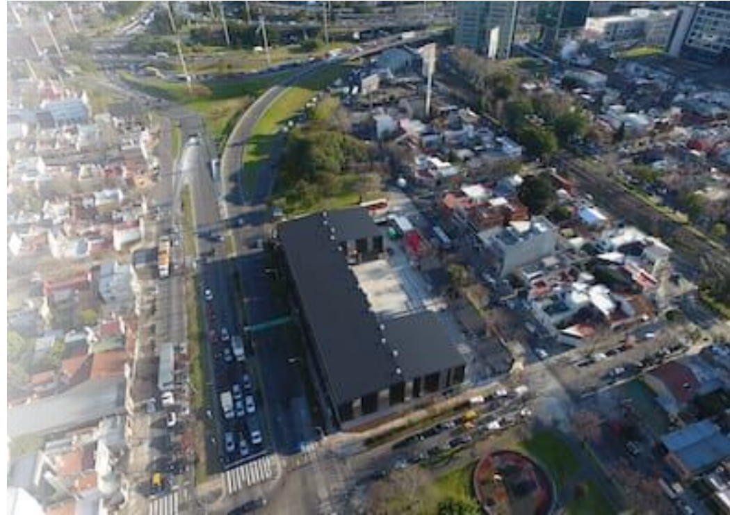
Recycling plant in Barracas, Buenos Aires